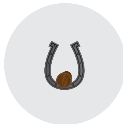
For more advanced students.