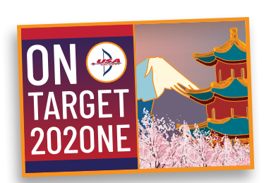
AWARDS MATCH On Target 2020NE USA ARCHERY PIN