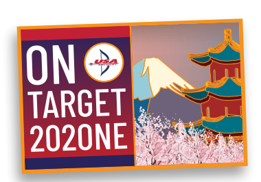
AWARDS MATCH On Target 2020NE USA ARCHERY PIN