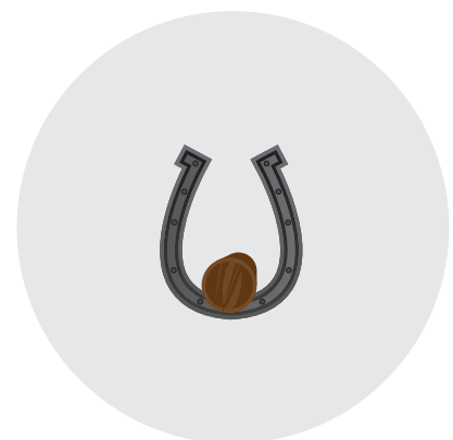
For more advanced students.