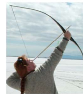
Modern American Longbow