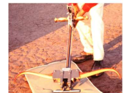
Unlimited Foot Bow